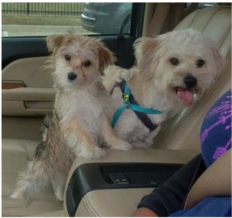
Free pet food, vaccines for cats and dogs, microchipping and vouchers for spay/neuter services will be available during "Dallas Pets are Family Day," Saturday, March 18th, from 9 a.m. to 1 p.m. at Dallas County Tax Office (8301 S Polk St).