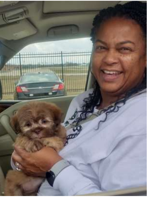
There is no charge to participated in "Dallas Pets are Family Day," Saturday, March 18th, from 9 a.m. to 1 p.m. at Dallas County Tax Office (8301 S Polk St). Pet food, vaccines for cats and dogs, microchipping and vouchers for spay/neuter services will be available.